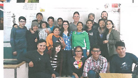
Deaf school in Ensenada