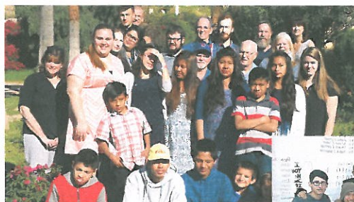
Ranch Sordo Mudo school in Valle de Guadalupe